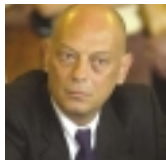
Deputy Mayor City of Ancona Lead partner

The AAP2020 engine is reaching full gear. The technical workshops held in Bari, Casarano and Bristol focused on innovative tools and produced the first draft of the Adriatic common set of indicators, one of the Local Sustainable Development tools. The Steering Committee had his first meeting in Ancona and appreciated the work in progress.